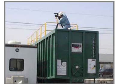
Shooting Video During Latest Installation