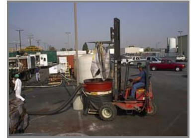
Loading ZVI Into Dustless Hopper for Injection

It's noteworthy that all three of these California PRBs are deeper than 100 ft bgs.