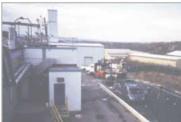
Construction of a Hydraulic Fracture Enhanced SVE System at an Operating Pesticide Plant

The fracture enhanced SVE system typically consists of a high vacuum high flow system to maximize the contaminant removal from the soil formation. A high vacuum stress is applied to the highly permeable fractures resulting in the rapid migration of contaminants in the soil towards the fractures. Such a system results in time to achieve remediation levels being typically 1-2 years.