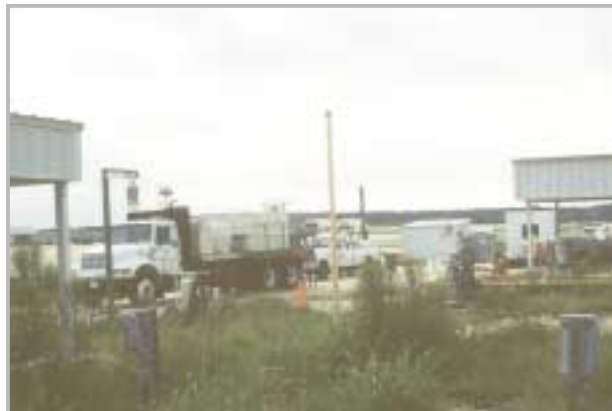
Fracture Enhance SVE System at a Military Base

GeoSierra has completed numerous fracture enhanced SVE projects at various sites throughout North America. Many of the projects are operating chemical or manufacturing facilities requiring horizontal fractures to be installed beneath and around existing buildings and utilities. The buildings are monitored by high precision bi-axial tilt meter and the fracture geometry recorded during injection by the active resistivity method.